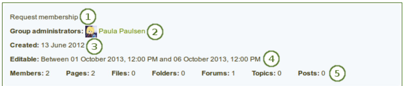
Items in the group info block

This block is a default block on the group homepage. There is no configuration possible.